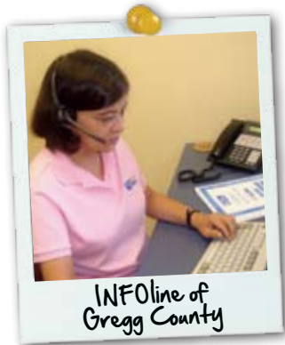
INFOline of Gregg County

Last year, INFOline of Gregg County helped nearly 3,900 callers get connected to services they needed.