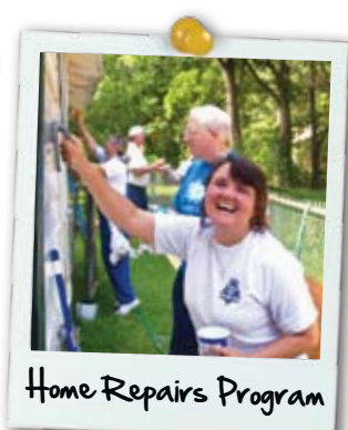
Home Repairs Program

Last year, INFOline of Gregg County helped nearly 3,900 callers get connected to services they needed.